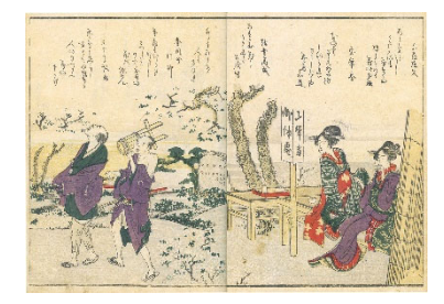
Katsushika Hokusai A Kyōka Picture Book: Mountain upon Mountains, Vol. 1 The Sumida Hokusai Museum (all term *1)

*1: This work will be replaced by another with the same title halfway through the exhibition.