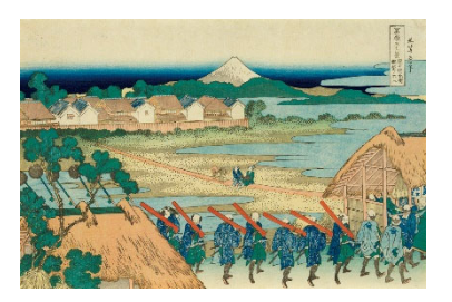
Katsushika Hokusai Mount Fuji seen in the Distance from Senju Pleasure Quarter, from the series Thirty-six Views of Mount Fuji The Sumida Hokusai Museum (all term *1)