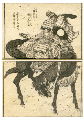
Katsushika Hokusai Hachiman Tarô Minamoto no Yoshile, from A Picture Book of Japanese Warriors, Illustrated, Vol. 1 The Sumida Hokusai Museum (all term)