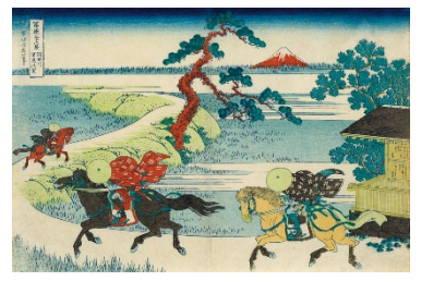
Katsushika Hokusai Sekiya Village on the Sumida River, from the series Thirty-six Views of Mount Fuji The Sumida Hokusai Museum (2nd term)