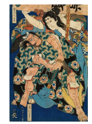
Katsushika Hokusai Kusunoki Tamonmaru Masashige and Yao no Bettö Tsunehisa The Sumida Hokusai Museum (1st term)