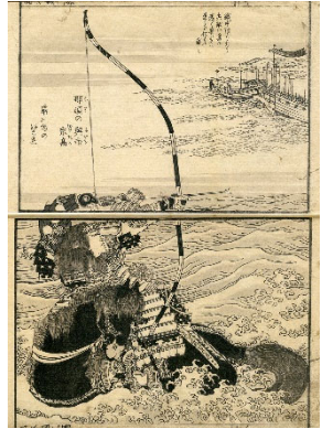
Katsushika Hokusai Honor to Nasu no Yoichi Munetaka for Shooting the Fan, from A Picture Book of Japanese Warriors, Illustrated, Vol. 2 The Sumida Hokusai Museum (all term)